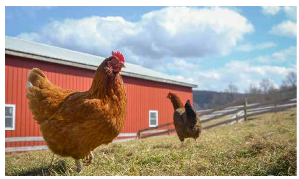
Chickens use their emotions to make decisions on what kinds of environments they prefer

take into account the positive and negative emotions these feeling animals experience. Further, by exploring animals' emotions, we illuminate another major facet of psychology that nonhumans share with humans. Indeed, studies that demonstrate the emotional lives of animals abound: with regards to birds in particular, for example, sparrows react emotionally to the songs of their fellows, European starlings experience mood shifts, and quail show fear. All of these studies provide evidence of not only negative emotions in birds, but positive emotions as well.