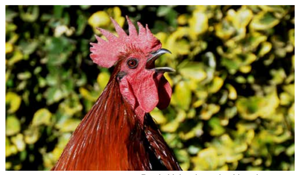
Boyd chicken is getting his point across

The variability of chickens' alarm calls becomes even more complex when taking into account roosters' attention to "audience effects," or the changes they make to how they communicate based on who is listening. For example, when a hen is present, a rooster is more likely to sound the alarm indicating an aerial predator, a calculation that increases the likelihood that his mate and children will survive the threat. Foosters also communicate in ways that simultaneously warn fellow chickens of danger and confuse predators who might be listening. Roosters are more likely to sound an alarm if a lower-ranking chicken is nearby, effectively giving the predator an additional target and increasing the signaling male's chance of survival. When hiding under a tree or a bush, roosters take into account what aerial predators can see: roosters give alarm calls that are longer in duration (and easier for predators to follow) when they are hidden under cover than when they are exposed.