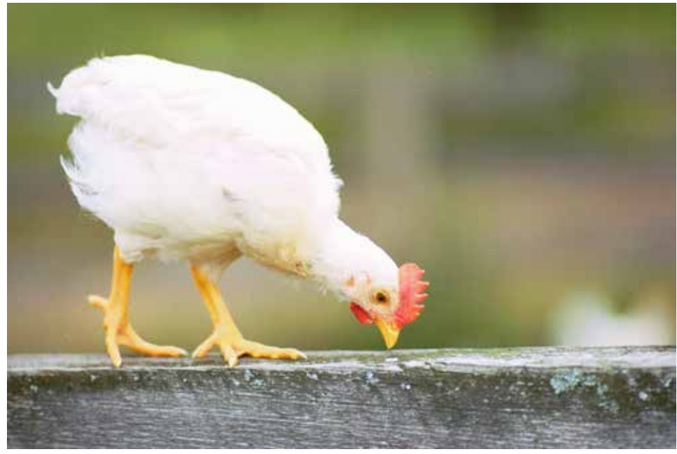
Mayfly chicken scratching

One of the chicken's most important sensory organs is her beak. Equipped with numerous nerve endings and a highly specialized, sensitive tip, the beak enables chickens to make precise distinctions between the objects they touch. Chickens also use their beaks to grasp and manipulate objects when eating, nesting, exploring, drinking, and preening. They even use their beaks as weapons when establishing their place in the social hierarchy and when defending themselves. Because of the beak's incredible sensitivity, damage to it causes her intense pain. In addition to their beaks, chickens are sensitive to touch, and their skin detects temperature, pressure, and pain thanks to numerous sensory receptors.