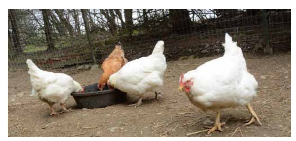
Hens like Thumbelina gain information by watching other hens interact

Perhaps most impressive about chicks' sense of number and quantity, however, is their ability to perform basic arithmetic.