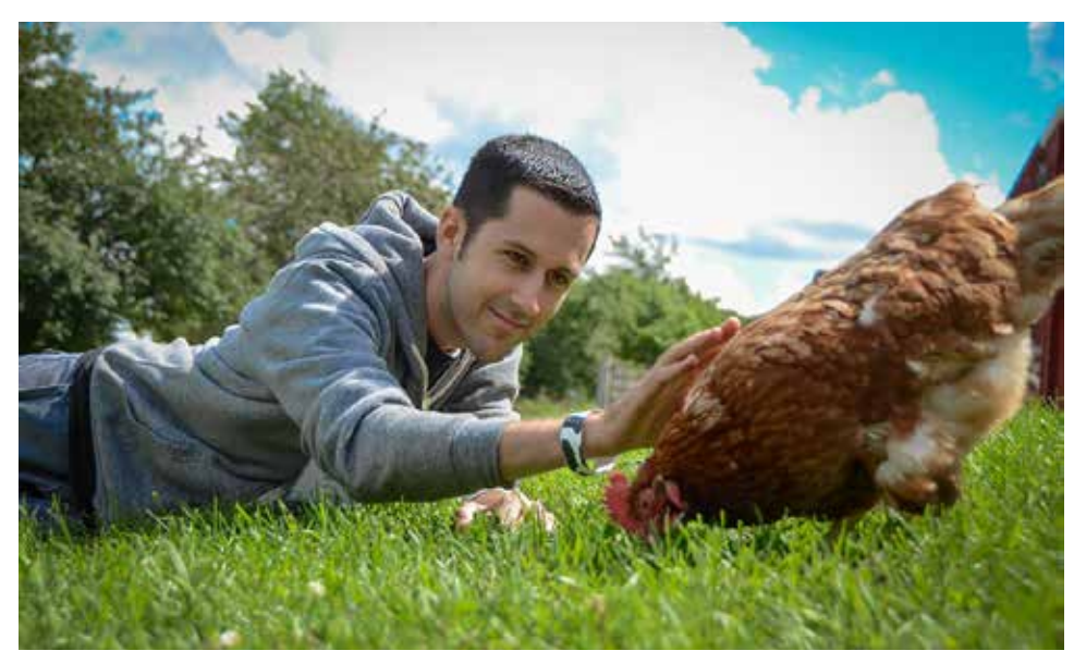
A visitor to Farm Sanctuary interacts with Penelope chicken

These conclusions only scratch the surface of who domestic chickens are: family members, group leaders, mothers, fathers, children, and, most of all, particular individuals who each maintain habits, preferences, and complex social relationships. The available research on chickens is quite suggestive. Even so, a fuller understanding of these fascinating creatures requires much more respectful, non-invasive study in naturalistic settings that allow chickens to express themselves and, in so doing, help us learn more about who they are. Therefore, inspired by what we do know about chickens, we hope for a future full of human-chicken relationships curious about and celebratory of what both species may share in common.