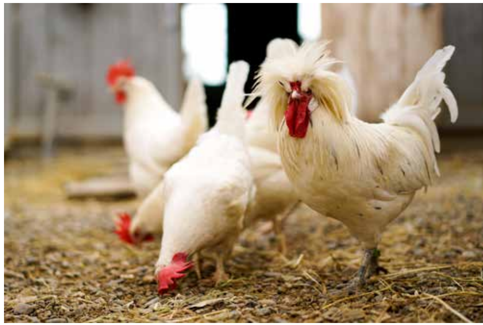
Rod Stewart with his flock

For both jungle fowl and wild or free-ranging domestic chickens, social groups are comprised of one dominant male, one dominant female, lower-ranking chickens of both sexes, and chicks. Group members live on a home range during their breeding season; within that range, they have regular roosting sites that include the lofty branches of trees. From berries and seeds, insects and small vertebrates, chickens eat a varied diet.