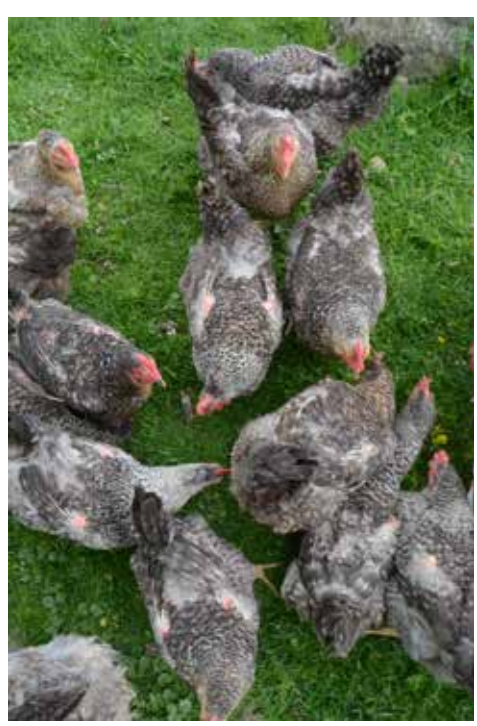
Bawking chickens

Bawk, bawk, bawk; cluck, cluck, cluck: chickens may be well-known for how their communication sounds when it falls on human ears, yet the ways chickens transfer information from one individual to another is far more complex than what we might hear on first listen. A critical component of social complexity, ample evidence exists that animal commu-