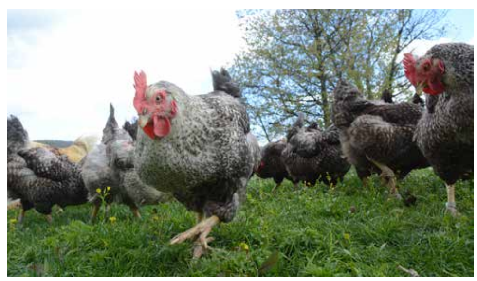
Chickens watch each other for social cues