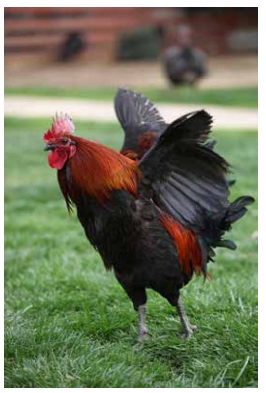
Ahmed rooster is Mr. Personality

Additional studies that examine the reactions of chicks to puffs of air show that mother hens can reduce their distress by acting as a social buffer. Interestingly, less emotional hens buffered their chicks' stress more effectively than very emotional individuals, 101 a finding that suggests that mother hens possess different maternal styles that likely correspond to differences in the hens' personalities.