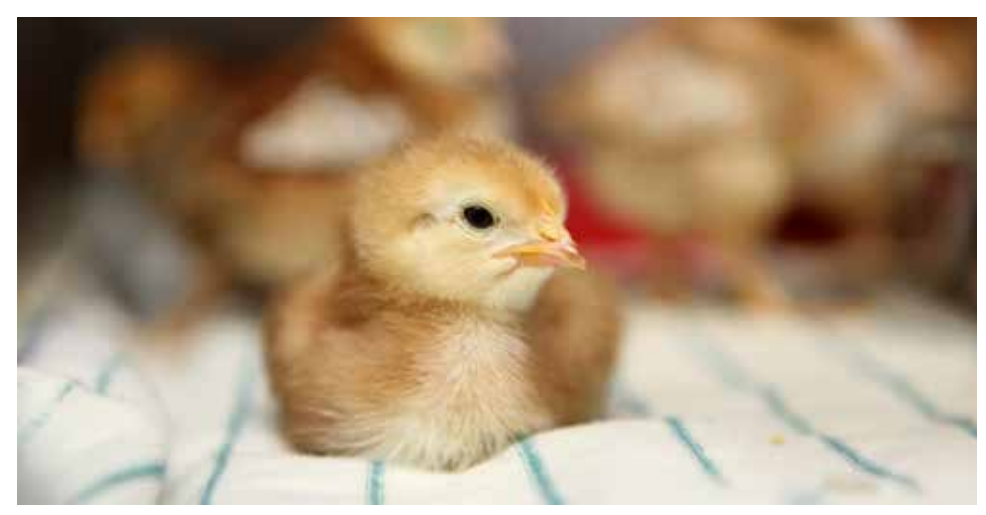
Chickens can use their past experiences to anticipate the future

touch screen would be rewarded after six minutes. After seeing the visual signal and waiting for about six minutes, hens pecked at the screen more frequently, showing that they could estimate the time required to get their reward.<sup>35</sup> In another study, hens learned to associate three sounds with either food (a good outcome), a squirt from a water gun (a bad outcome), or nothing (a neutral outcome); these outcomes arrived 15 seconds after the sound. Hens showed different emotional responses to the sounds, demonstrating that they anticipated either a positive, negative, or neutral outcome based on their understanding of what the sounds foretold.<sup>36</sup> In short, chickens can not only estimate time intervals, but also use their past experiences to anticipate the future.