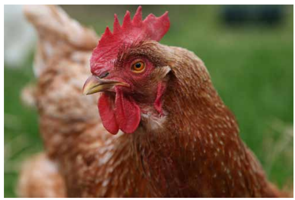
Brooks chicken looking very smug with her own intelligence

Self-awareness describes an animal's understanding of who she is to herself: that is, her sense of herself as an "I" independent from others. Often associated with a range of complex psychological capacities that include phenomenal consciousness (what it feels like to have an experience), self-consciousness (awareness of oneself as an individual), metacognition (the ability to think about one's own thoughts), and autonoetic consciousness (the ability to mentally orient oneself in the past, present, and future), self-awareness is not a cognitive feature that should be understood as simply available or unavailable. Instead, self-awareness is a concept best defined as a continuum.<sup>51</sup>